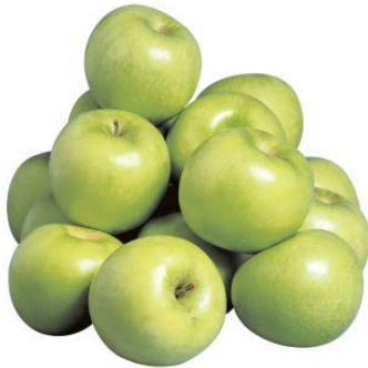
Apples - $4.99 /5 lb. bag