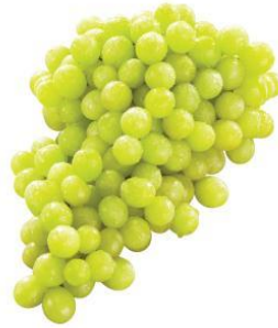
Grapes - 89¢/lb.