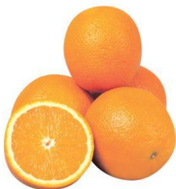
Oranges - $5.99/5 lb. bag