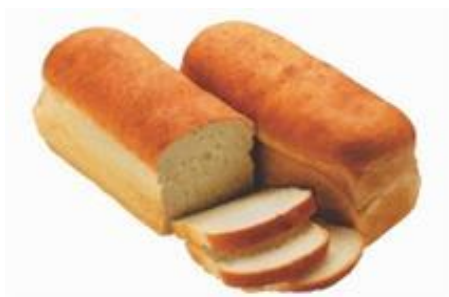
Whole wheat bread $2.39/loaf