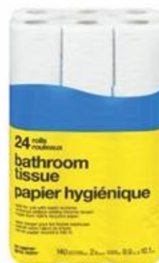
Toilet paper - $5.79/24 rolls