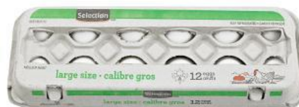
Eggs - $2.39/dozen