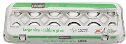
Eggs - $2.85 /dozen