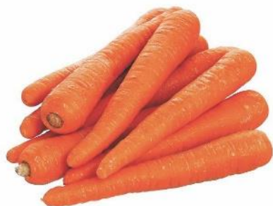
Carrots - $2.79 /5 lb. bag