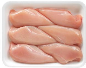
Chicken breasts - $4.88 /lb